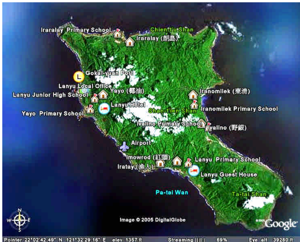
Figure 2. Geographic description of Lanyu

In and near Imowrod are the airport, post office, clinic, and a hotel. Right across Imowrod at the opposite side of the island is Ivalino, where the Lanyu Nuclear Waste Plant is located. The administrative center of the island is at Yayo, where a hotel and a secondary school can be found. Iraralay and Iranomilek are further away from the government offices and tend to better preserve the Yami language. However, all villages have primary schools with Mandarin Chinese as the only medium of education. Recently, with the development of tourism, an increasing number of remodeled homes have been opened for room and board for tourists, especially on the more scenic beach on the northeast coast.